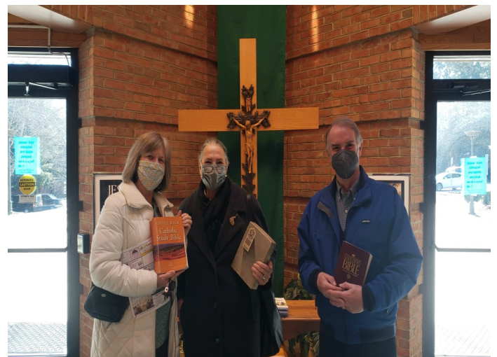
"BLESSING OF THE BIBLES"