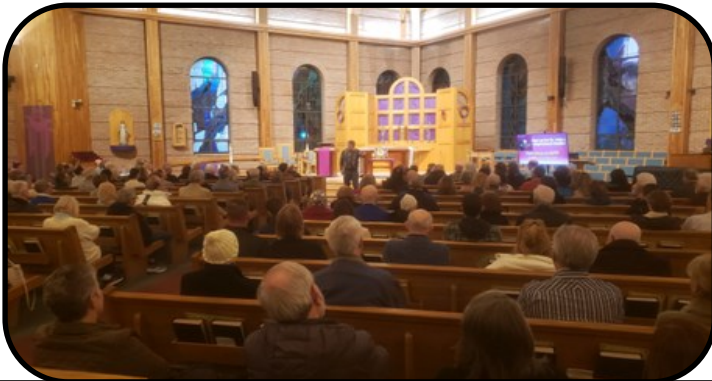
"FULL HOUSE! FIRST NIGHT OF PARISH MISSION."