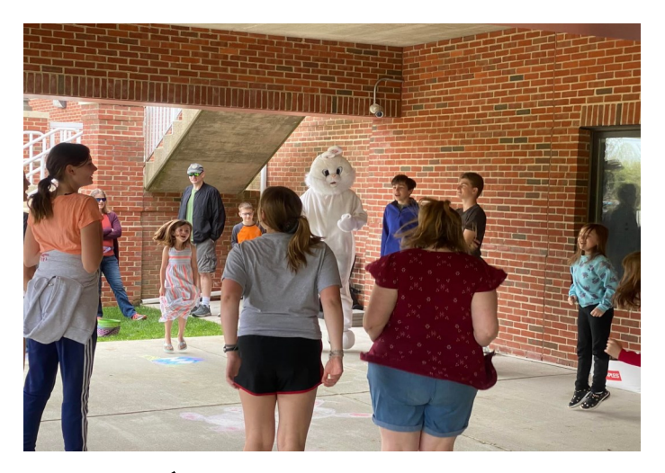
A WHOLE LOT OF "HOPPING FUN" AT THE EASTER EGG HUNT!