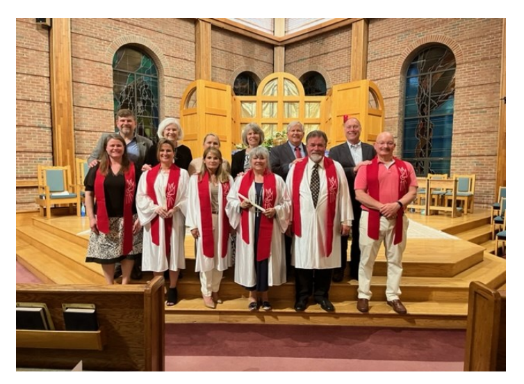
CONGRATULATIONS RCIA CLASS 2022!