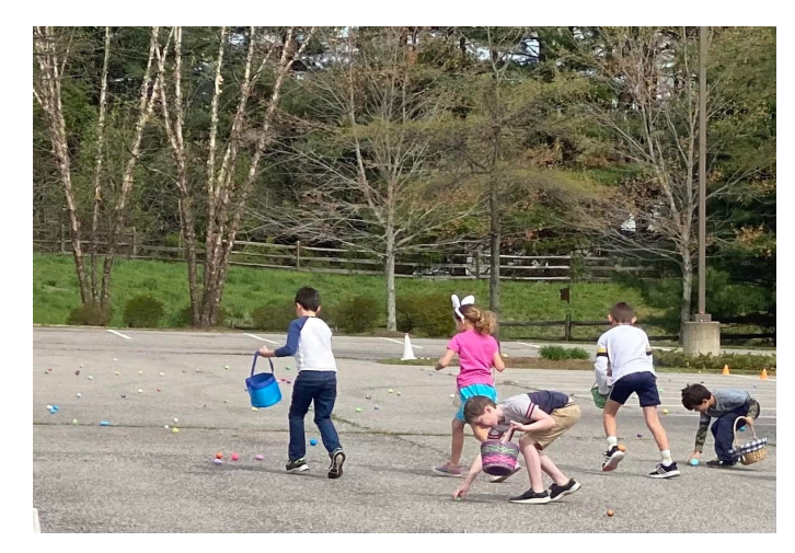
O' MÝ, LOOK AT ALL THESE EASTER EGGS: WHICH WAY SHOULD I GO?

THANK YOU TO ALL THE VOLUNTEERS AND KIDS THAT CAME TO THE EASTER EGG HUNT. FUN WAS HAD BY ALL!