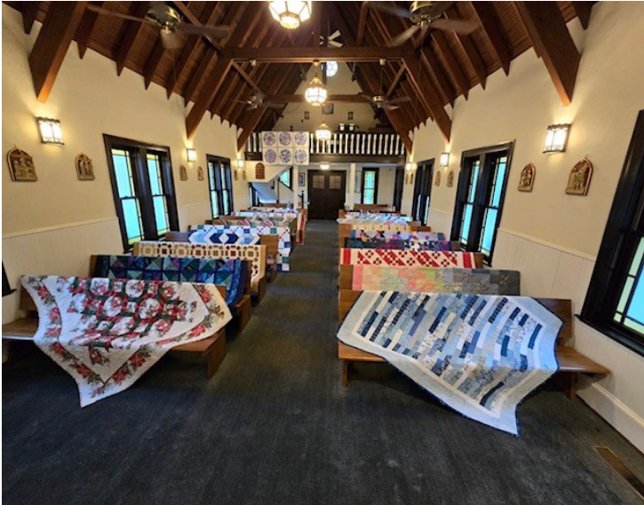
Sew Time Display Quilts for Haiti Quilt Bingo