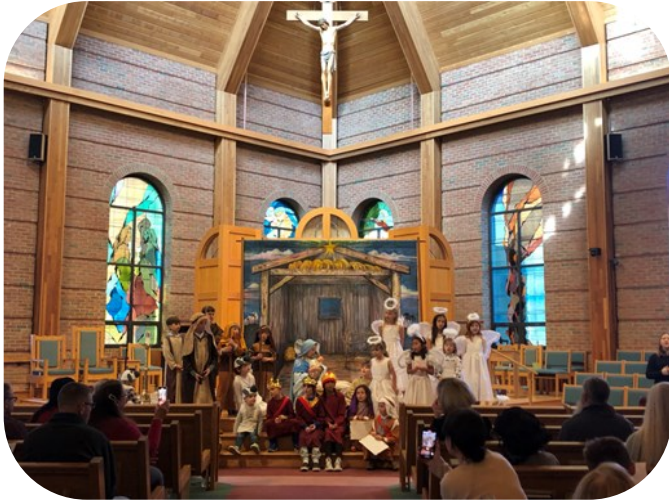
2022 CHILDREN'S CHRISTMAS PAGEANT. GREAT JOB!

Thank you for your continued generosity!