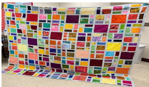
JACOB'S LADDER QUILT