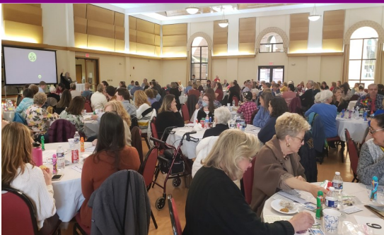
ANXIOUSLY HOPING FOR A "BINGO!"