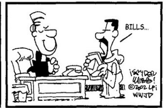
2ND SUNDAY OF EASTER