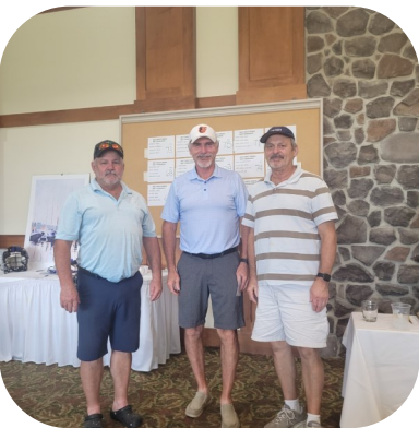
LOWEST SCORE FOR 18 HOLES!