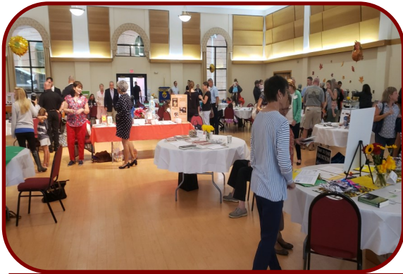
THANK YOU TO ALL WHO ATTENDED THE 2022 MINISTRY FAIR!