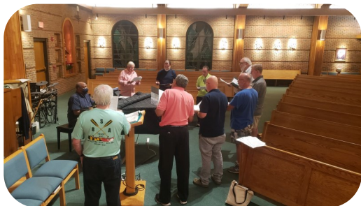
OUR MEN'S CHOIR SINGING AT A RECENT REHEARSAL