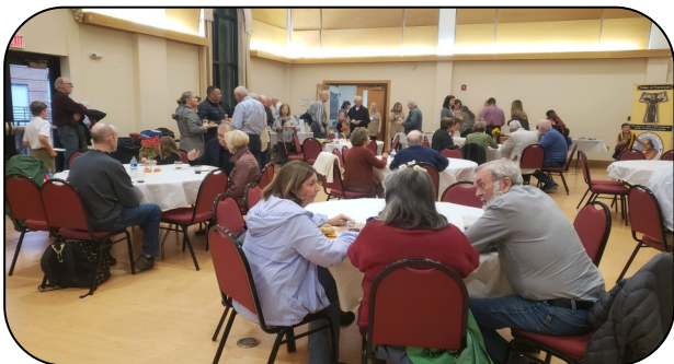
WINE AND CHEESE ENJOYED BY ALL! HOSTED BY THE SECULAR FRANCISCANS.