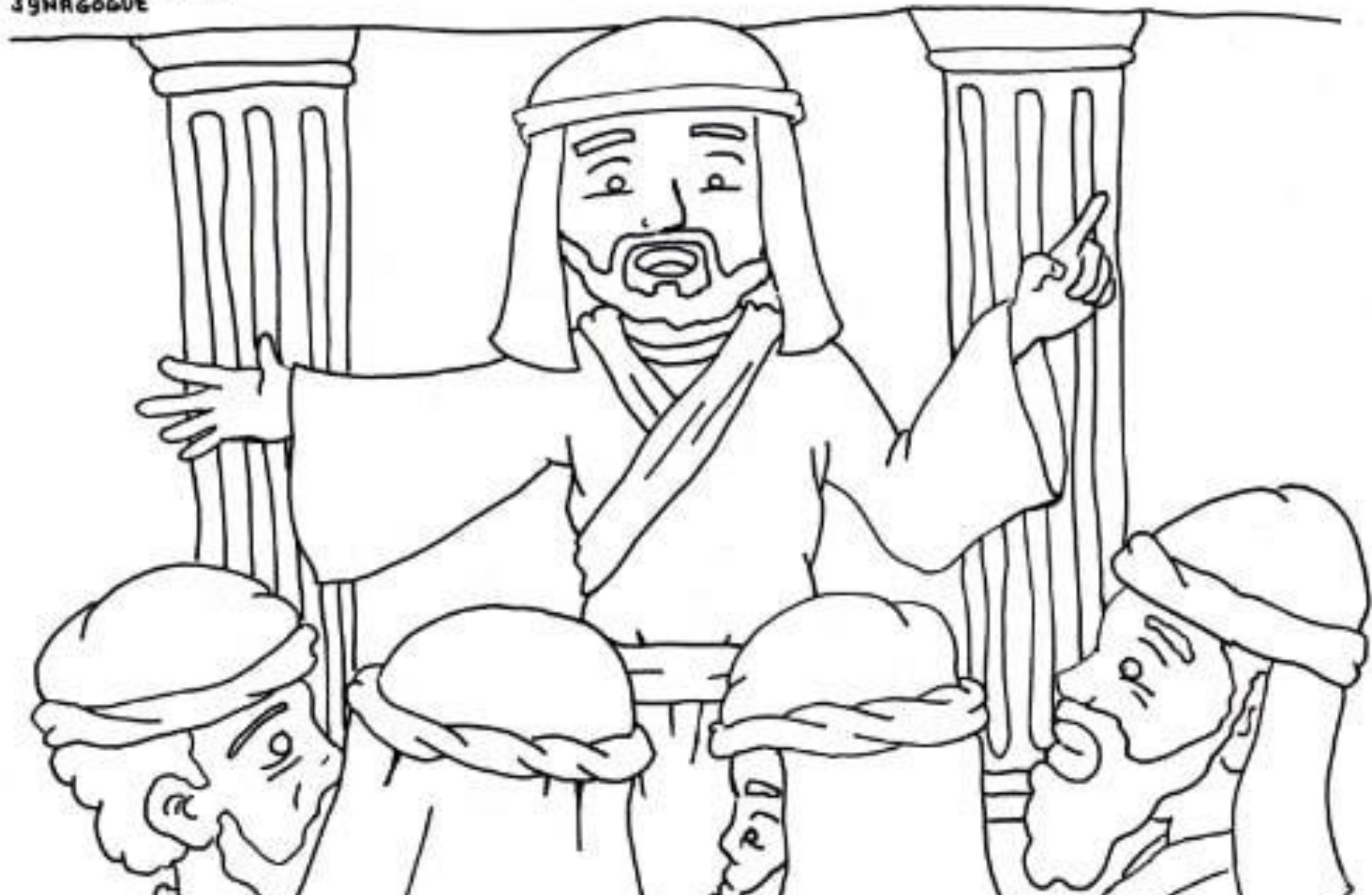
PAUL PREACHING AT THE SYNAGOGUE